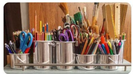
Art Group Friday 9:00 - 11:00