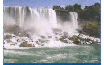
Experience a Majestic View of the Falls