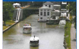
Enjoy a Cruise along the Erie Canal

Departure: Senior Center, 1485 E. Oakley Park Rd, Commerce Township, MI @ 8 am