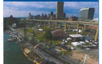
Visit to Buffalo's Canalside